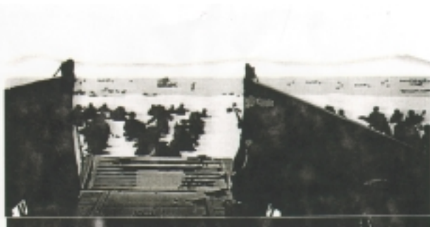
Matt Romey 311 E. Bay Ave #2 Newport Beach, CA 92661

- Next month: A review of ASL Journal #1